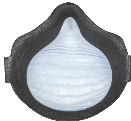
Full Foam Flange on 4150 Series