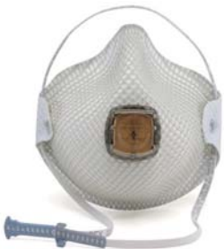
2700V 2700N95 HandyStrap® Respirator with Ventex® Valve 2 Per Pack / 40 Packs Per Case