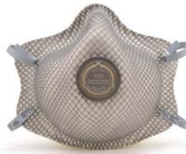
2310V 2310N99 Respirators 2 Per Pack / 40 Packs Per Case