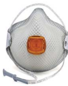
2800V 2800N95 Plus Nuisance Organic Vapors HandyStrap® Respirators with Ventex® Valve 2 Per Pack / 40 Packs Per Case