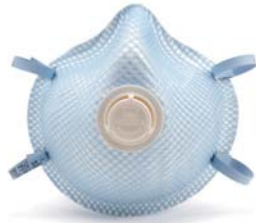
2300V 2300N95 Respirators 2 Per Pack / 40 Packs Per Case