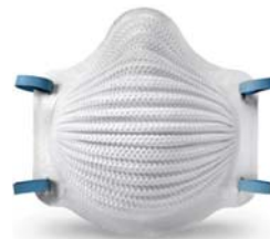
4200V 4200 N95 AirWave® Respirators 2 Per Pack / 40 Packs Per Case