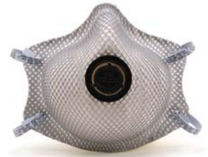
2400V 2400N95 Plus Nuisance Organic Vapors Respirators 2 Per Pack / 40 Packs Per Case