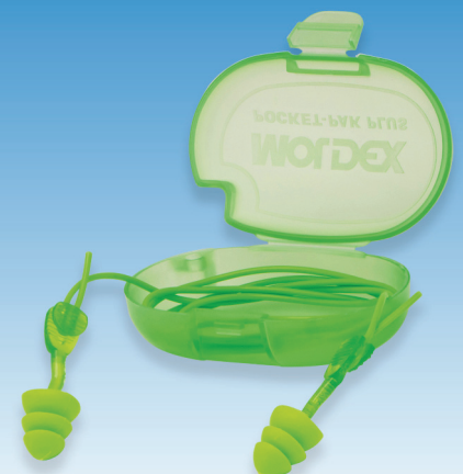
6465 Glide Trio Reusable Corded Earplugs w/ Pocket-Pak