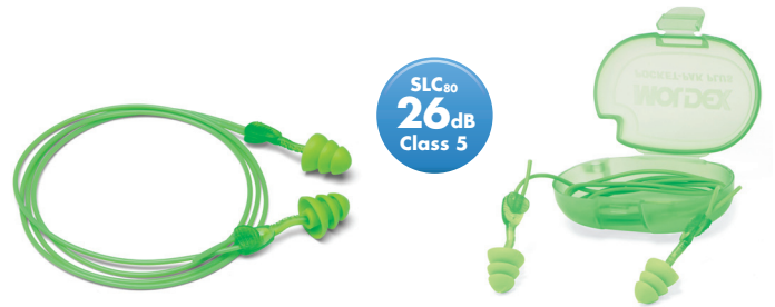
6445 Glide Trio Triple Flange Reusable Earplugs w/ Cord

NEW ZEALAND 3 Spence Road Henderson, Auckland, NZ TEL: +64 (9) 837 8247 FAX: +64 (9) 837 8248 E-mail: moldexnz@moldex.com www.moldex.com