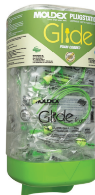
6883 GLIDE Foam with Cord PlugStation