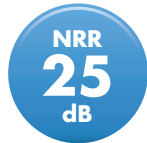
6495 Comets Corded