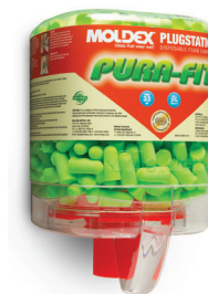
6844 Pura-Fit, PlugStation Uncorded / 250 Pairs