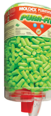
6845 Pura-Fit, PlugStation Uncorded / 500 Pairs