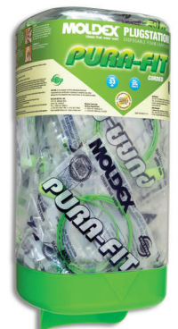
6882 Pura-Fit, PlugStation Corded / 150 Pairs