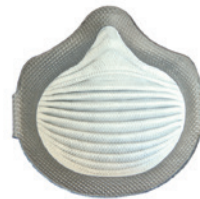
Foam Face Cushion