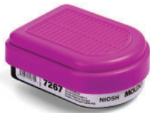
Acid Gas Cartridge/P100