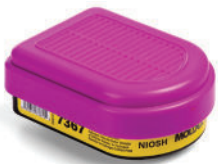
Organic Vapor/Acid Gas Cartridge/P100