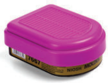
Multi-Gas/Vapor Smart Cartridge/P100