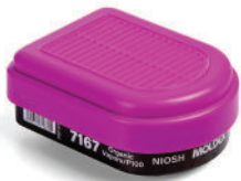
Organic Vapor Cartridge/P100

Moldex introduces the latest innovation in respiratory protection- the NEW #7067 Series Combo Gas/Vapor Cartridges/ P100 Filter. The Moldex #7067 Series combines cartridges and filters into a fully integrated, easy-to-attach unit, offering maximum convenience, broader based protection, and class leading comfort.