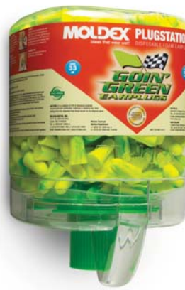
6647 Goin' Green PlugStation Uncorded