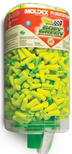
6646 Goin' Green PlugStation Uncorded