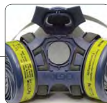
Attached exhale cover for easy inspection