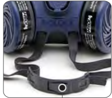
Contoured neck buckles for comfort and quick attachment