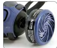
Easy mount bayonet cartridge/filter attachment