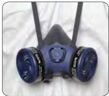
7000 in Drop Down Mode