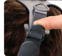
Over-molded buckles for secure strap attachment. One finger strap release