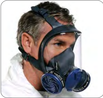
Easy to wear