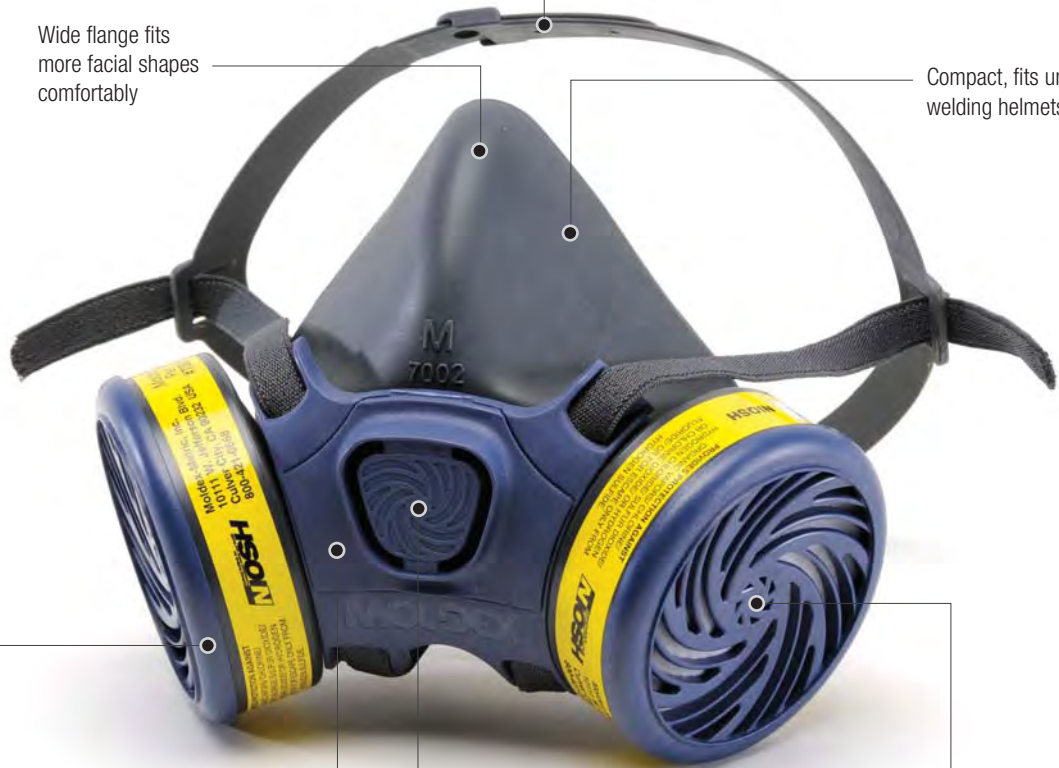
Compact, fits under welding helmets