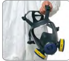
Lightest weight facepiece of any popular model. Weighs less than 12.7 oz.